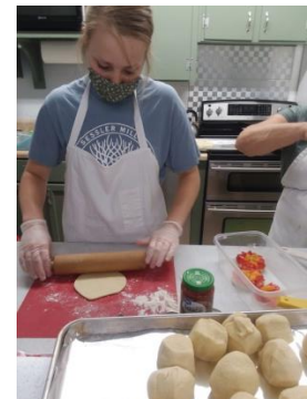
making her own pizza dough