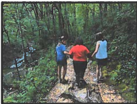
Friends from the After-School Program help one another down a trail on a recent hike once we re-started children’s activities

Consistency is key for us here at Friendship House. We don’t know what the immediate future holds, but we know the King who holds all of time in his good hands. As servants of that king, we will continue to love our neighbors. We’ve re-started our children’s program and will continue to provide a reliable time and safe space for the neighborhood kids to come and play and eat and learn about Jesus. The stranger who comes to us fleeing war or famine will be given refuge in our apartment.