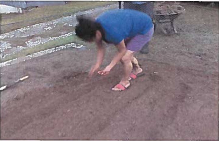
planting the seeds