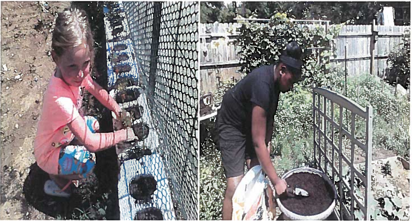
2 of our children planting flowers for natural pest control in the BCC garden