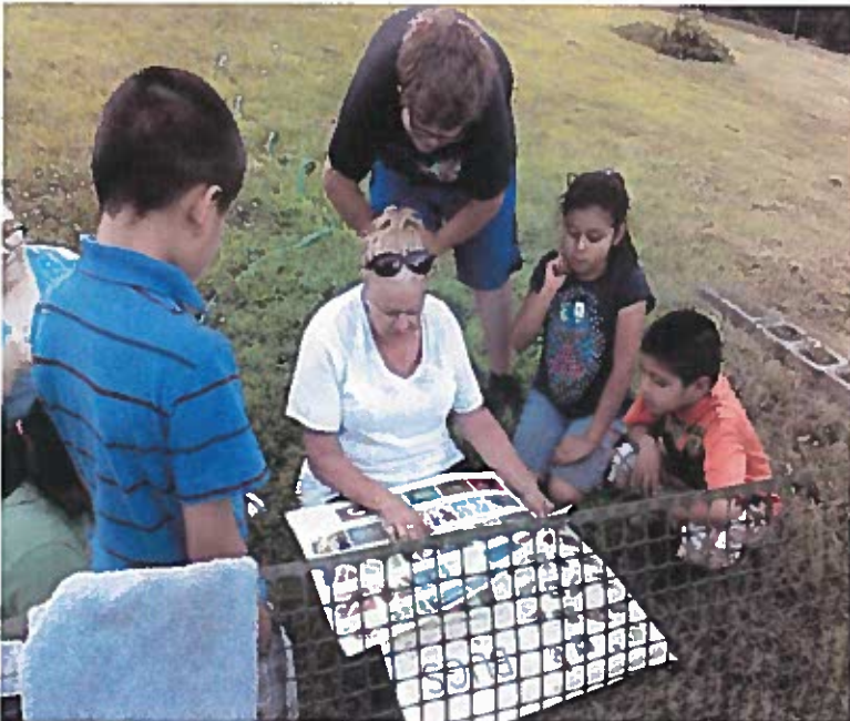
lessons on good and bad bugs