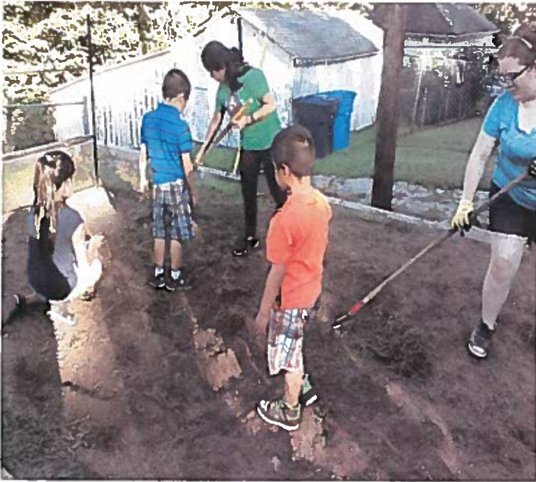
clearing the garden space