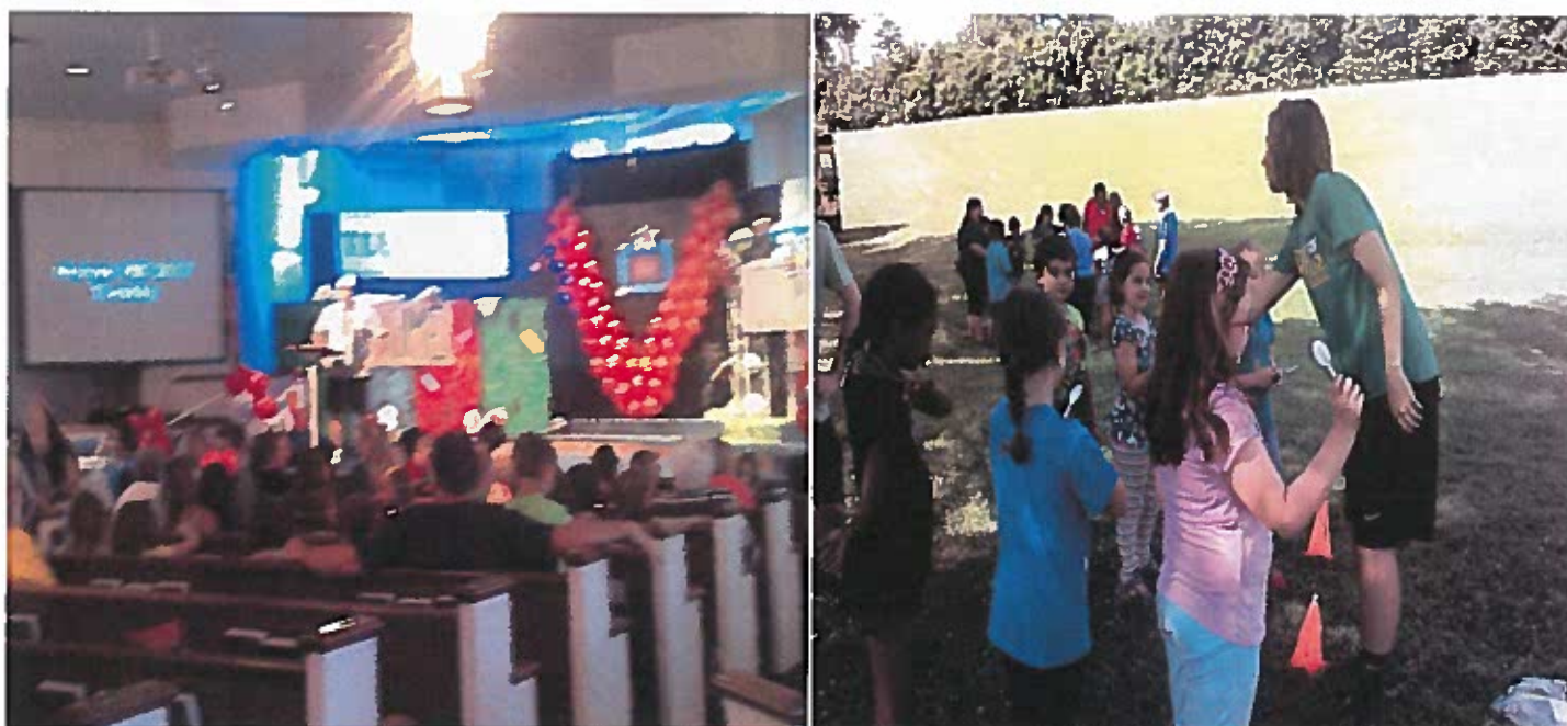
Our children enjoying VBS at Melrose Baptist. What a great Pep Rally, Victory in Jesus