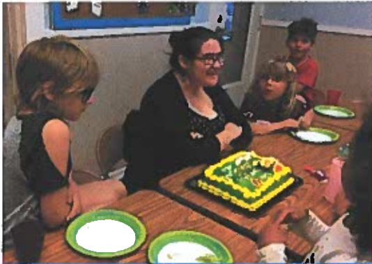
Celebrating our Roanoke College Volunteer's Graduation!

Call to prayer: The special night of prayer at the Friendship House in March was a very sweet time. Our next night of prayer is June 13th from 6:30-7:30 at the Friendship House! It is such a great practice and important work. We hope you can join us!