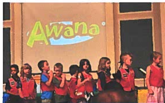
Awana Award Night

***Summer hours vary, please call to drop off donations!***