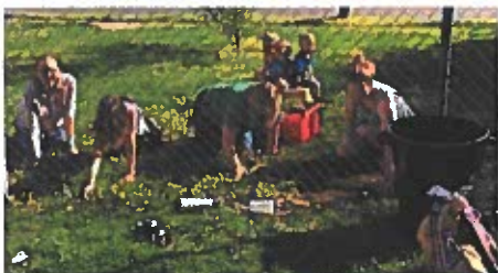
Working Hard Planting the Garden

Needs: Food Dehydrator for preserving garden produce and the fresh produce we get from donations.