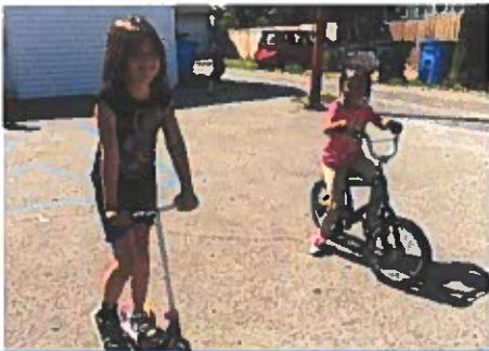
Learning to Ride!

Spring time is fun time at the Friendship House. As the kids continue learning God's Word and finish school, the nice weather means learning outside activities as well. For example, we had 4 kids learned to ride a bike this week! At $300 per semester, our after school program offers a great value for the investment. Please prayerfully consider helping us continue this ministry to our neighborhood children by sponsoring a child.