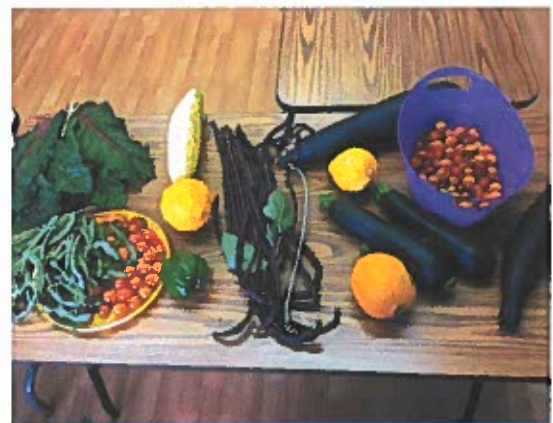
Produce from our Garden