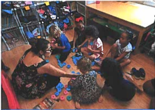
Making "pool noodle" flowers with our partners from the library