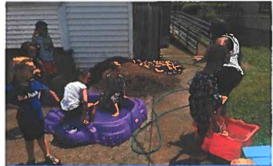
Beating the Heat!