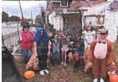
Pictures from top to bottom: Birthday celebrations, enjoying playing outside, snack after working hard on school assignments, pumpkin scavenger hunt in the garden, learning about the nativity, sweet potato harvest from a garden program participant, tomatoes from our garden, turkeys being prepared for our families meals