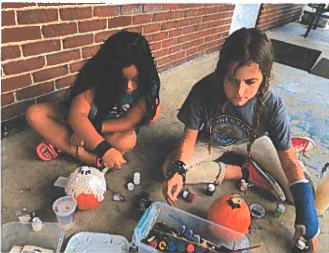
We spent a recent afternoon painting pumpkins

Here at Friendship House, we intend on loving our neighbor, regardless of the season. As we approach Thanksgiving and Christmas, we have two special ways for you, your family, your office, or your church to join us. Check out our mini-flyers on the other side!