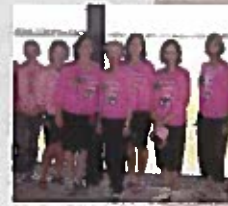
BAHAMA MAMAS Steel Drum Band