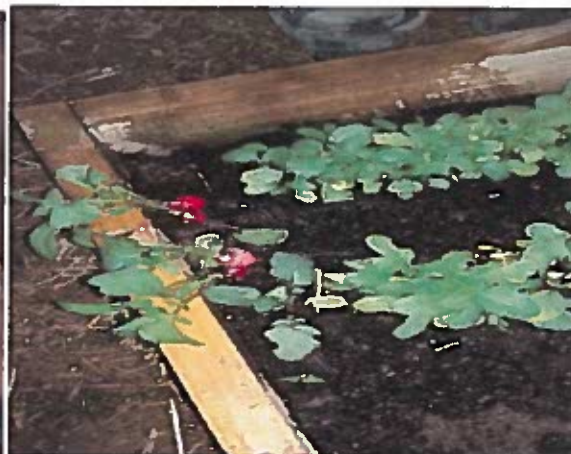
Joyce Ikenberry (Melrose Bapt) helps supervise after school children separate and bag hats and gloves for students at Fallon Park Elementary, Feb 13 we delivered over 600 sets of hats and gloves to show the students we love them, 2 RA's mixing up a treat for movie day, our Little Lambs planting pepper seeds and making peanut butter pine cones for birds, radishes in our cold frame