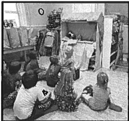
Some of our kids enjoy a recent puppet show at Friendship House.

After a lot of prayer and waiting for local schools to make final decisions, our After-