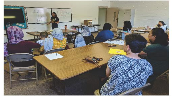
A Friendship House English Club in operation at a local church

That Friendship House Offers to Equip and Mobilize Churches to Reach the Roanoke Community