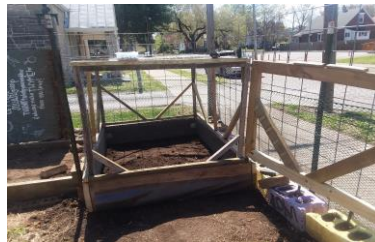
one of the critter proof cages

If a grant is received we will need a paid summer part time pre K lead teacher and assistant for 6 weeks, please check May 1 if interested.