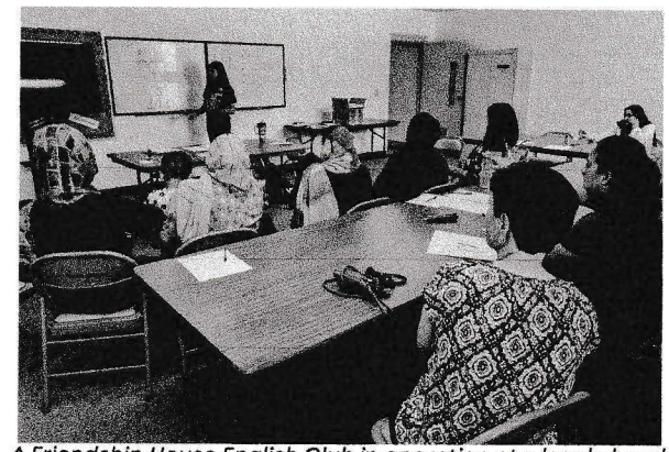
A Friendship House English Club in operation at a local church

That Friendship House Offers to Equip and Mobilize Churches to Reach the Roanoke Community